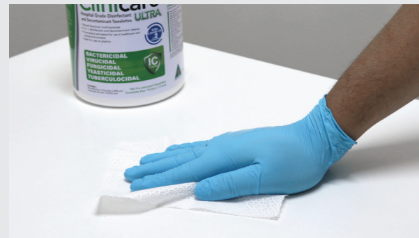
B: Wiping from dirty to clean in an S-shaped pattern, ensuring not to go over the same area twice