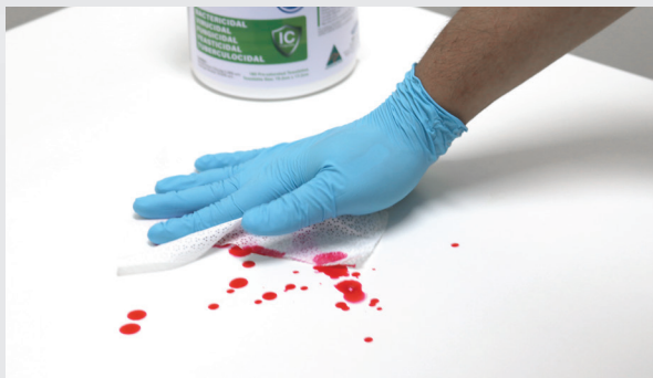
B: Wiping from dirty to clean in an S-shaped pattern, ensuring not to go over the same area twice