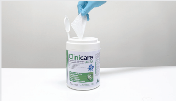
A. Dispense Clinicare towelette