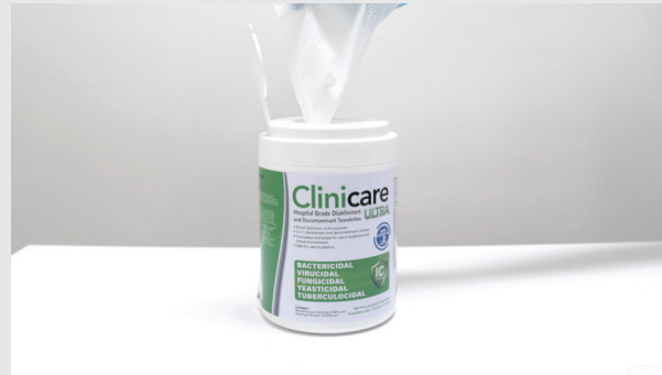
A. Dispense another Clinicare towelette